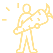
Nutrition Champion $10,000