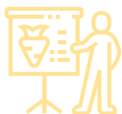
Exclusive Presenting $15,000