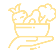
Neighborhood Nourisher $5,000